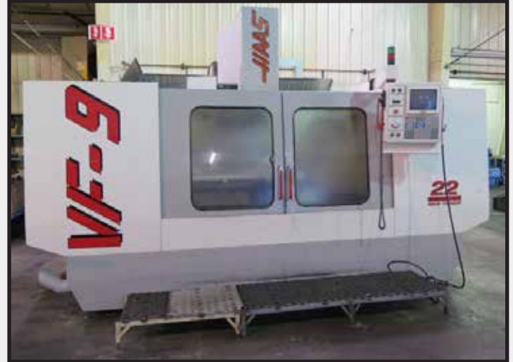
1996 Haas VF-9 4-Axis CNC Vertical Machining Center s/n 8936 w/ Haas Controls, 20-Station ATC, CAT-40 Taper Spindle, 7500 RPM, Thru Spindle Coolant, Brushless Servos, Programmable Coolant Nozzle, Quick Code, Rigid Tapping, Chip Auger, 36" x 84" Table, 40" x 85" Aluminum Top Plate, Coolant