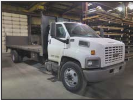
2006 GMC C6500 24' Stake Bed Truck w/ Diesel Engine, Automatic Trans, Tommy Lift Gate, 151,690 Miles