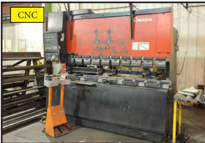
1993 Amada FBD-8025E 80 Ton x 98" CNC Press Brake s/n 8500677 w/ Amada NC9-EX II Controls, 98.4" Bed Length, 98.6" Max Bend Length, 15.75" Throat, 3.94" Stroke, 86.6" Between Uprights, 14.57" Open Height