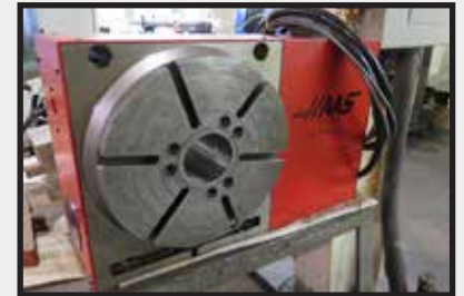
Haas HRT-310 12" 4th Axis Rotary Head w/ Trunion Attachment and Support