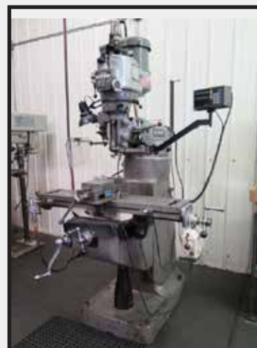
Bridgeport Vertical Mill s/n 264127 w/ Sony Millman DRO, 2Hp Motor, 60-4200 Dial Change RPM, Power Drawbar, Chrome Ways, Power Feed