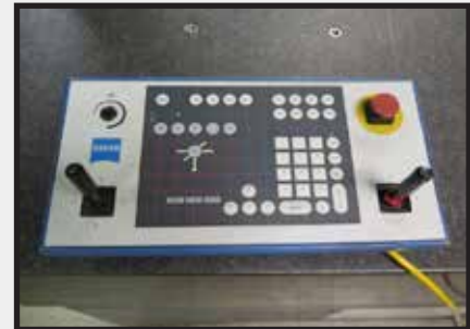
1997 Zeiss ECLIPSE 4040 CMM Machine s/n CMM970203058 w/ Zeiss ST Dynamic Probe, 5-Station Automatic Probe Changer, 28" x 40" x 20" Work Envelope, 36" x 52" Granite Table, Zeiss Joystick Controller, 0.00008" Repeatability, 0.00002" Resolution, U-Soft Software