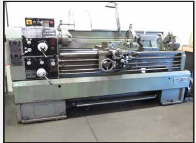
Sharp mdl. 1760K 17" x 60" Gear Head Gap Bed Lathe s/n 74602 w/ 50-1800 RPM, Inch/mm Threading, 2" Thru Spindle Bore, Tailstock, Steady and Follow Rests