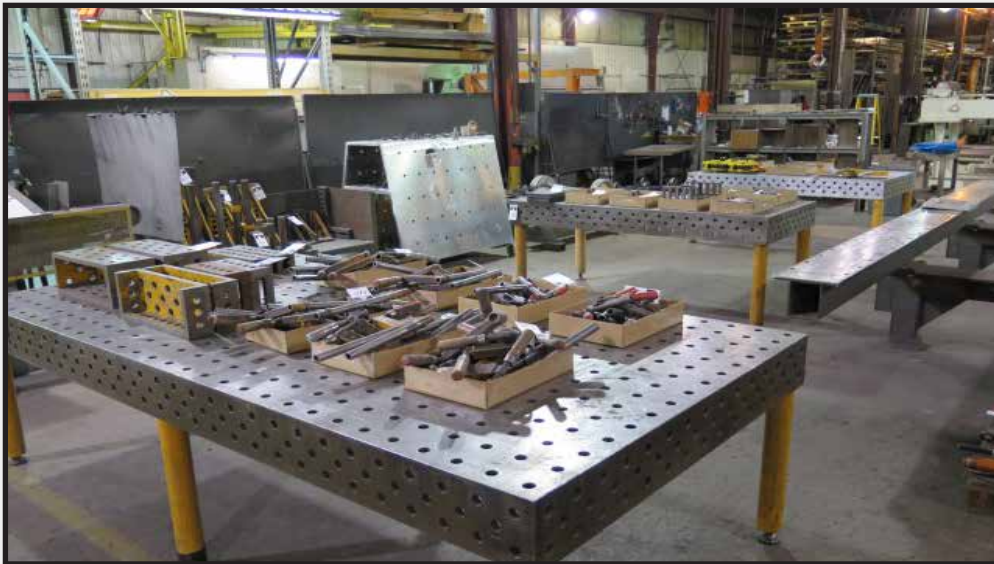
Demmeler Fixturing Tables w/ Accessories 3-AVAILABLE