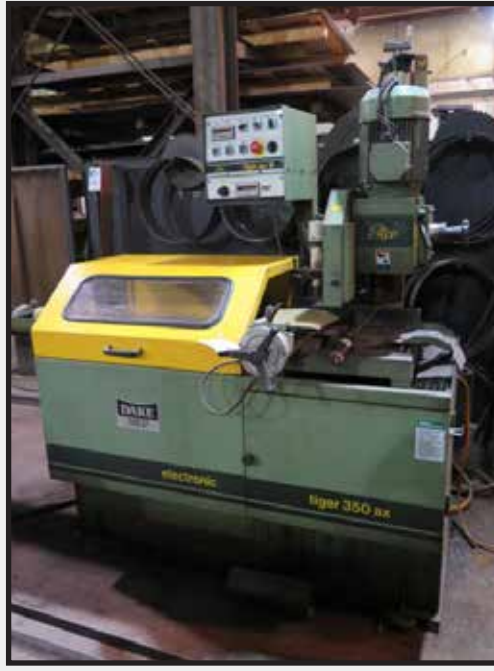
MEP Type TIGER 350AX Automatic Miter Cold Saw s/n 006014 w/ Tiger AX PLC Controls, Auto Feeds, Pneumatic Clamping