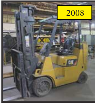
2008 Caterpillar GC40K-LP-STR 7300 Lb Cap LPG Forklift s/n AT87A20326 w/ 3-Stage Mast, 209" Lift Height, Side Shift, Solid Tires, 6445 Metered Hours