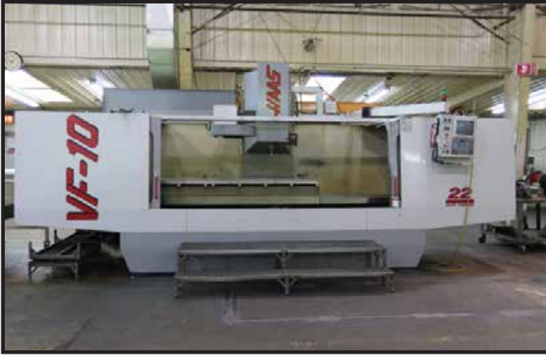
1997 Haas VF-10 4-Axis CNC Vertical Machining Center s/n 9759 w/ Haas Controls, 20-Station ATC, CAT-40 Taper Spindle, 10,000 RPM, Thru Spindle Coolant, 120" x 31" x 30" Travels, Hand Wheel, Brushless Servos, Programmable Coolant Nozzle, Quick Code, Rigid Tapping, Chip Auger, Coolant