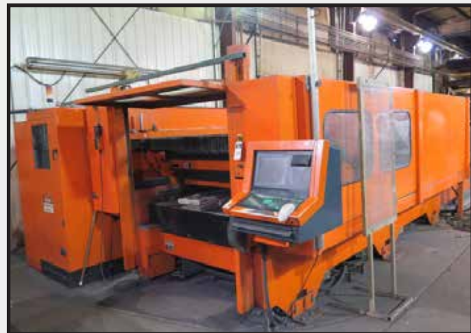
1998 Bystronic "By Sprint 2512.2" 2-Pallet CNC Laser Contour Cutting Machine s/n 60 w/ Bystronic Controls, 6-Pallet Shuttle System, 50" x 122" Pallets, Bystronic Automatic Vacuum Sheet Loading System, Bystronic Laser BTL1800 1800 Watt Laser Source, Koolant Koolers Cooling Unit, laser was just recently fully refurbished and cleaned.