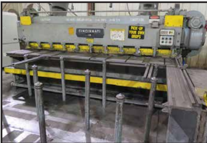
Cincinnati mdl. 1810 1/4" x 10' Deep Throat Power Shear s/n 34627 w/ Cincinnati Controlled Back Gaging, 18" Throat, 80" Squaring Arm with 51" Swing-Out Expansion