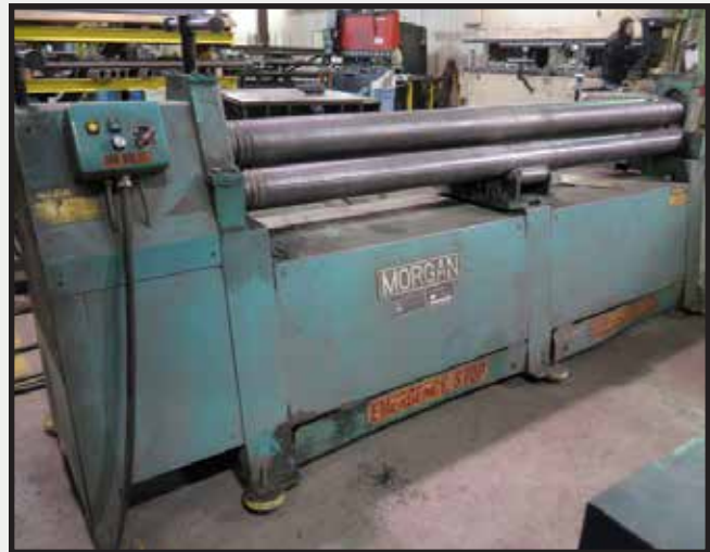
Morgan mdl. PBR2500 100" Power Roll w/ 6" Upper Roll, 5" Lower Rolls