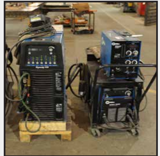
MILLER DYNASTY WELDER