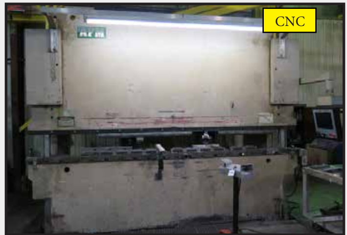
AFM mdl. EP13-220 220 Ton x 13' CNC Hydraulic Press Brake s/n CHPB/9-71439 w/ PC800 controlled Back Gaging, 13'4" Bed Length, 135 1/2" Between Uprights, 16" Throat