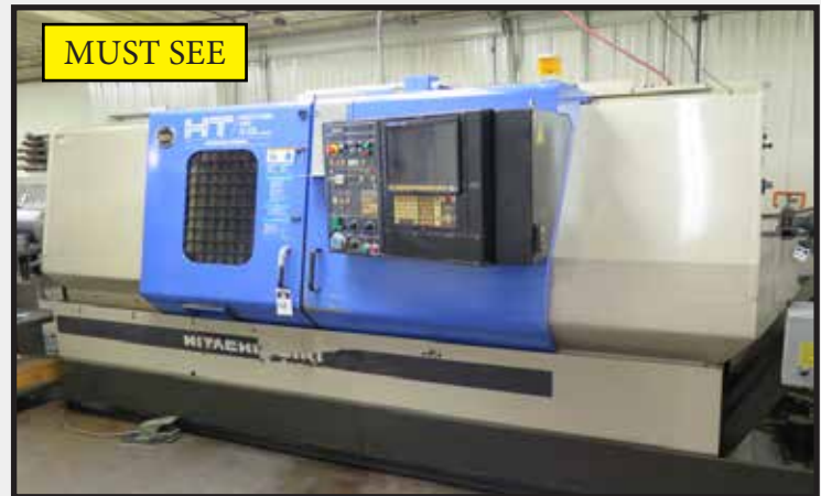
1996 Hitachi Seiki Hitec-Turn 25G CNC Turning Center s/n 25300 w/ Hitachi Seicos LIII Controls, Tool Presetter, 12-Station Turret, 3500 RPM, 14" Swing, 41" Turning Length, 2.625" Thru Spindle Bore, Hydraulic Tailstock, Parts Catcher, 10" 3-Jaw Powr Chuck, 5C Collet Nose, S26 Collet Pad Nose, Chip Conveyer, Coolant, LNS Hydrobar mdl. 6.65HS-5.2 6-Tube Hydraulic Bar Feed