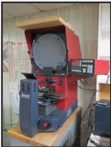
Starrett Sigma mdl. HB400 16" Optical Comparator s/n 4632 w/ Quadra-Chek Programmable DRO, Digital Angular Readout, Shadow Detector, Surface and Profile Illumination, 5" x 17" Table, Compound Fixture, Kennedy 5-Drawer Maple Top Work Bench