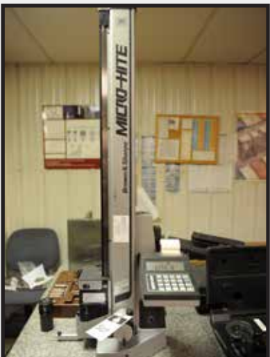
Brown & Sharpe Micro-Hite Height Gage