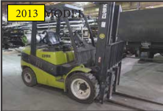
2013 MODEL Clark mdl. C500-800 8000 Lb Cap LPG Forklift s/n 685-277-2906 w/ 2-Stage Mast, 123" Lift Height, Solid Tires