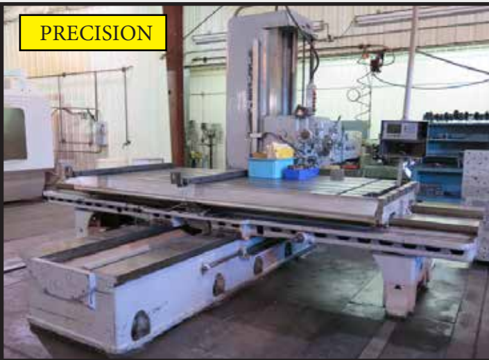
Giddings & Lewis mdl. 340-T Horizontal Boring Mill s/n 150-253-57 w/ 110" x 48" x 60" Travels, 26" Quill Travel, Acu-Rite DRO, 10-1300 RPM, 4" Spindle, Power Feeds, 48" x 122" Table