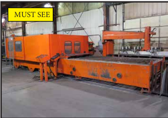
1995 Bystronic BYSTAR 3015 2-Pallet CNC Laser Contour Cutting Machine s/n 341 w/ Bystronic Controls, 5' x 10' Cap, Bystronic Automatic Vacuum Sheet Loading System, Rotary Tube Option with 12" 4-Jaw Chuck and 5 3/4" Thru Bore, Bystronic Laser BTL2800 Turbo 2800 Watt Laser Source, Koolant Koolers Cooling System, Lazervac 2442 Dust Collection System