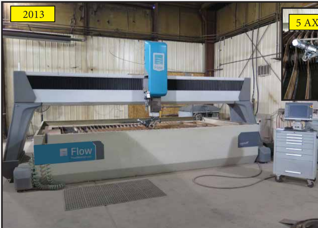
2013 Flow Mach 4 mdl. M4C 4020XD 5-Axis CNC Water Jet Contour Cutting Machine s/n 77595 w/ Flow Controls, "FlowCUT" Software, XD 5-Axis Cutting Head, Flow Hyperjet 50 94,000 PSI Upgraded Intensifier, 7 1/2' x 14' Work Area, Expandable to 60', Axxiom mdl. 4.5CF Garnet Hopper