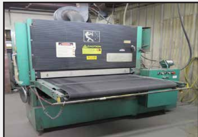
Timesavers mdl. 243-1 43" Speed Belt Grainer s/n 7856 w/ Dust Collector