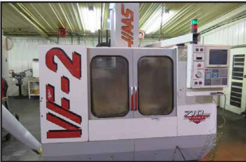
1997 Haas VF-2 4-Axis CNC Vertical Machining Center s/n 9963 w/ Haas Controls, 20-Station ATC, CAT-40 Taper Spindle, 7500 RPM, Brushless Servos, Quick Code, Rigid Tapping, Programmable Coolant Nozzle, Chip Auger, Coolant