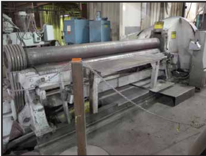
Bertsch Size #9 122" Initial Pinch Type Power Plate Roll s/n M-7888 w/ 5/16" x 10' Cap