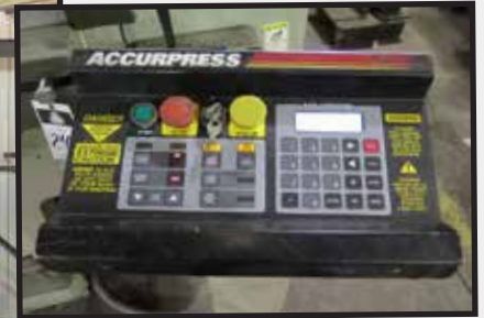
2006 Accurpress mdl. 740024 400 Ton x 24' CNC Hydraulic Press Brake s/n 8724 w/ Accurpress ETS Pedestal Controls, 24' Bed Length, 20' Between Uprights, 10 1/4" Throat