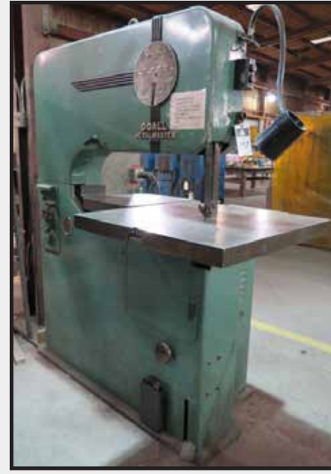
DoAll "Metal Master" 36" Vertical Band Saw w/ Blade Welder