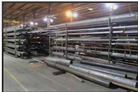
Large Quantities of Stainless Steel, Aluminum and CRS Bar, Tube and Angle Stock (most material will have certification)